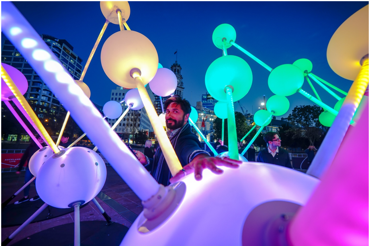
Affinity interactive light display.

Stratford, Ontario, June 6, 2022 – Although it's summertime, Lights On Stratford is laser-focused on next winter and is excited to announce the second of several major light art installations.