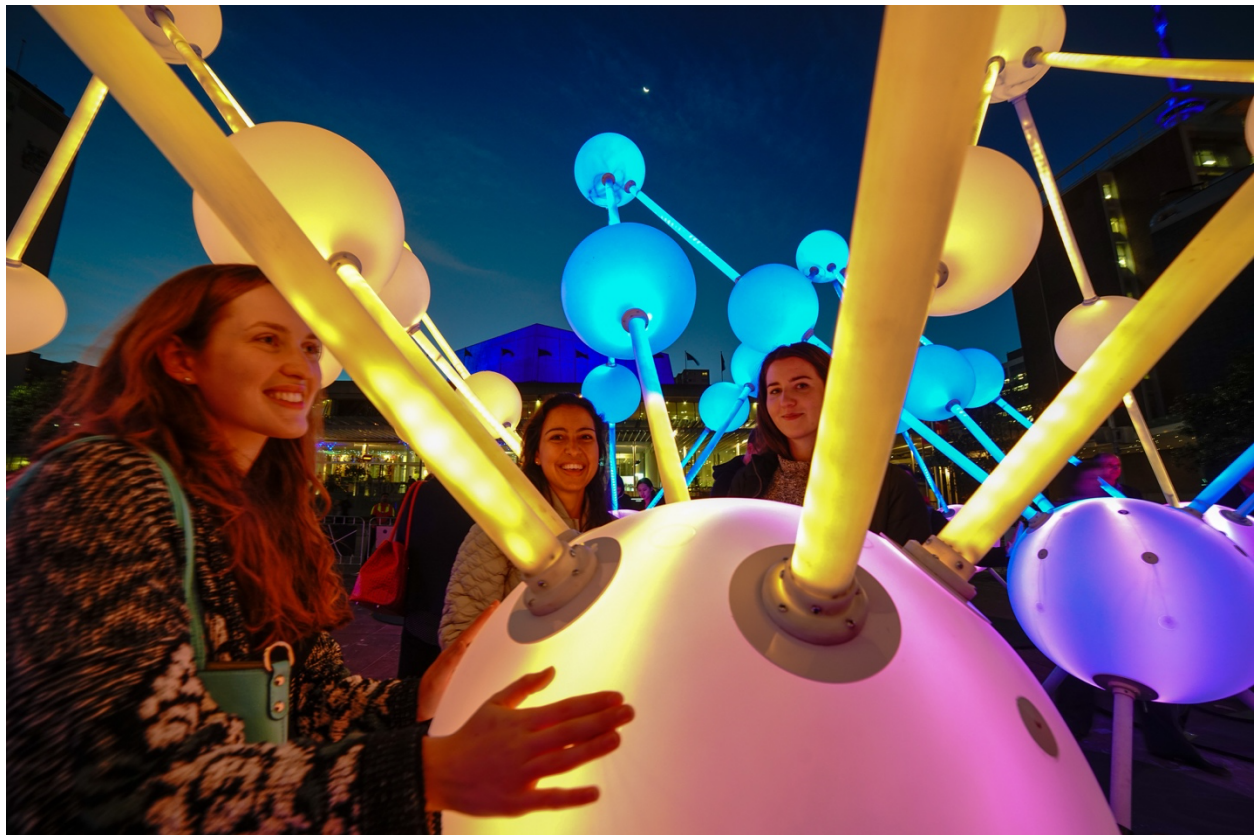
Affinity interactive light display.